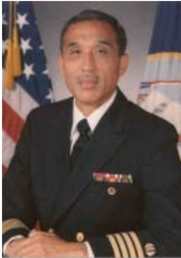
CAPT GLENN N. GONZALEZ, JAGC, USN FORCE JUDGE ADVOCATE, NAVAL RESERVE FORCE

TELEPHONE NO. (504) 678-5180; FAX NO. (504) 678-0170 EMAIL ADDRESS: surfn00j@cnrf.navy.mil