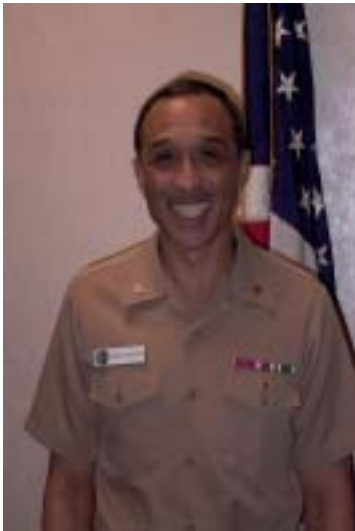
CAPT GLENN N. GONZALEZ, JAGC, USN FORCE JUDGE ADVOCATE, NAVAL RESERVE FORCE

TELEPHONE NO. (504) 678-5180; FAX NO. (504) 678-0170 EMAIL ADDRESS: surfn00j@cnrf.navy.mil